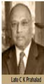
Late C K Prahalad