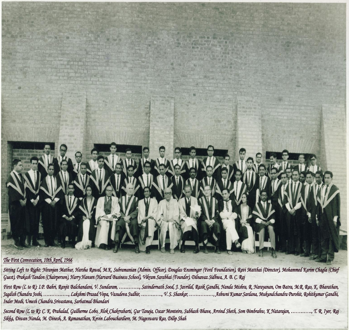
The First Convocation, 10th April, 1966