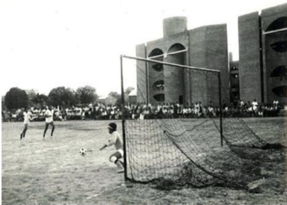
Football at IIMA (1970s)

"The sport that captivated the campus from the 1970s through the 1990s was football. IIMA had a dedicated men's football team consisting of staff and a few students who participated in leading local tournaments such as the 1st Division League Trophy of the Ahmedabad District Football Association and Paulin Cup. Mahindra & Mahindra would host an open football tournament on our campus grounds (in an area now part of the New Campus). In fact, there was a time when some members of our staff were recruited because of their footballing prowess!"