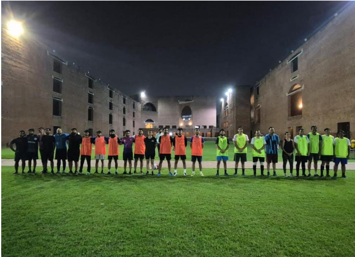
The IIMA Faculty Football Fanatics beat the IIMA PhD students 1-0 in a historic encounter on 6 November 2025. In the picture, the faculty are wearing the green bibs while the students are wearing the red ones.