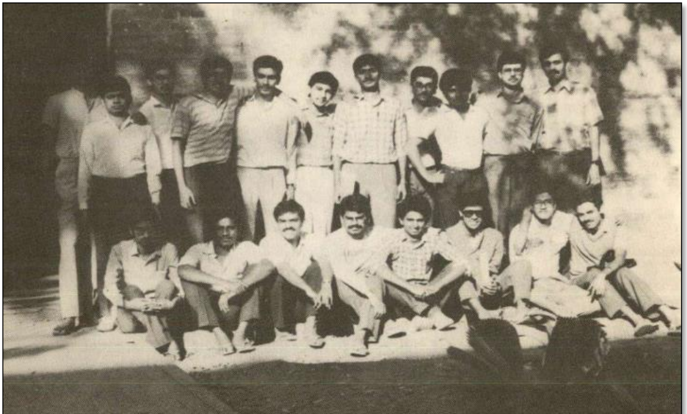
Students of Dorm 4