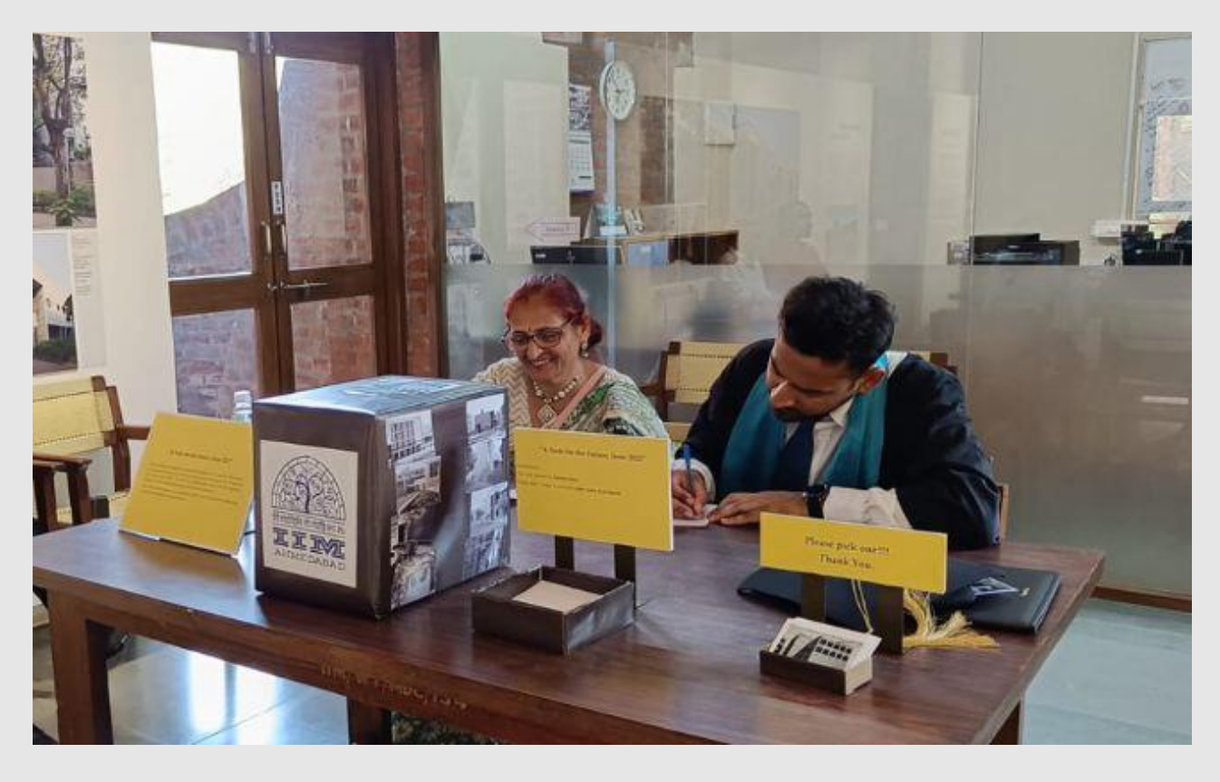
'A Note for the Future, from 2022' Campaign by IIMA Archives

IIMA Archives has started to reach out to other archives and museums such as the Gujarat State Archives, CEPT Archives, HCP Archives, LD Museum, and Centre for Heritage Management, Ahmedabad University. We hope to report on the progress of this outreach in the next issue of this newsletter. Please visit the IIMA Archives at Dorm 15 (Ground Floor), Main Campus, IIM Ahmedabad, Vastrapur, Ahmedabad - 380015, also you can mail us at <a href="mailto:archives@iima.ac.in">archives@iima.ac.in</a>, and our contact number is (079) 7152-7528.