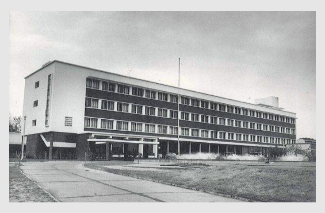
ATIRA, where classes were held initially, 1964