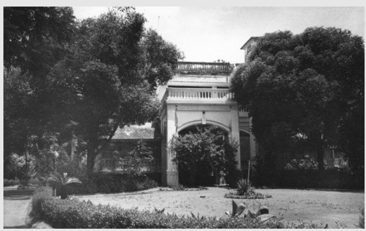
310, Camp Road', 1962, external view