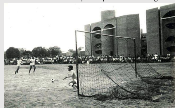
Football at IIMA (1970s)

Paulin Cup. Mahindra & Mahindra would host an open football tournament on our campus grounds (in an area now part of the New Campus). In fact, there was a time when some members of our staff were recruited because of their footballing prowess!