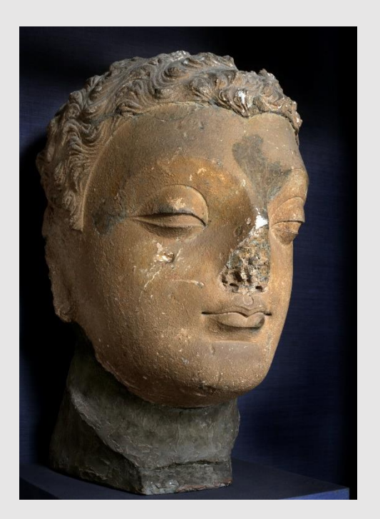
Buddha head, Stucco, Gandhara, 5th century CE, LD Museum, Ahmedabad

(invitation) from Ahmedabad (1796), several rare cosmological diagrams called Adhidvipa (c.1440 A.D.) and the Jaina Siddha-Chakra-Yantra.