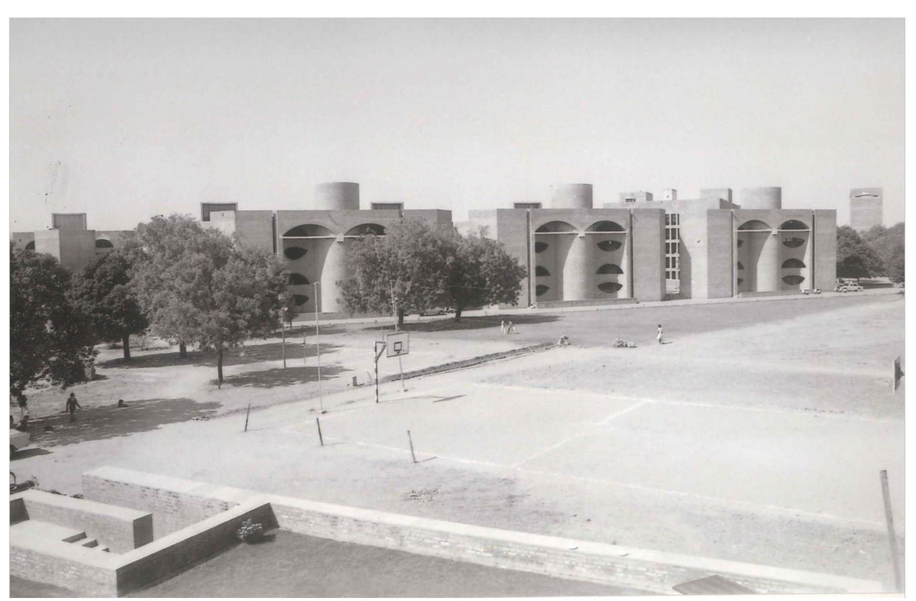
Picture of Dorm-16, 17 and 18 and the ground opposite.